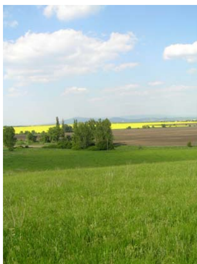
Soil, plant, environment

Branch currently has 47 members, 11 honorary members, and 2 Honorary Ltd. members.